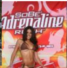
FASHION BIKINI CONTEST