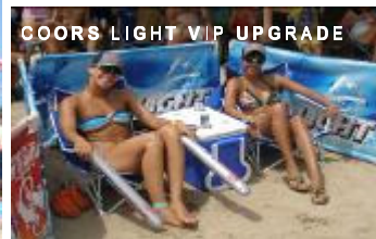
COORS LIGHT VIP UPGRADE